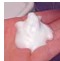
La consistance de la mousse permet d'économiser la consommation d'eau